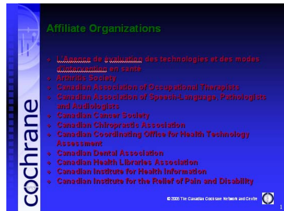
Example of a bad slide